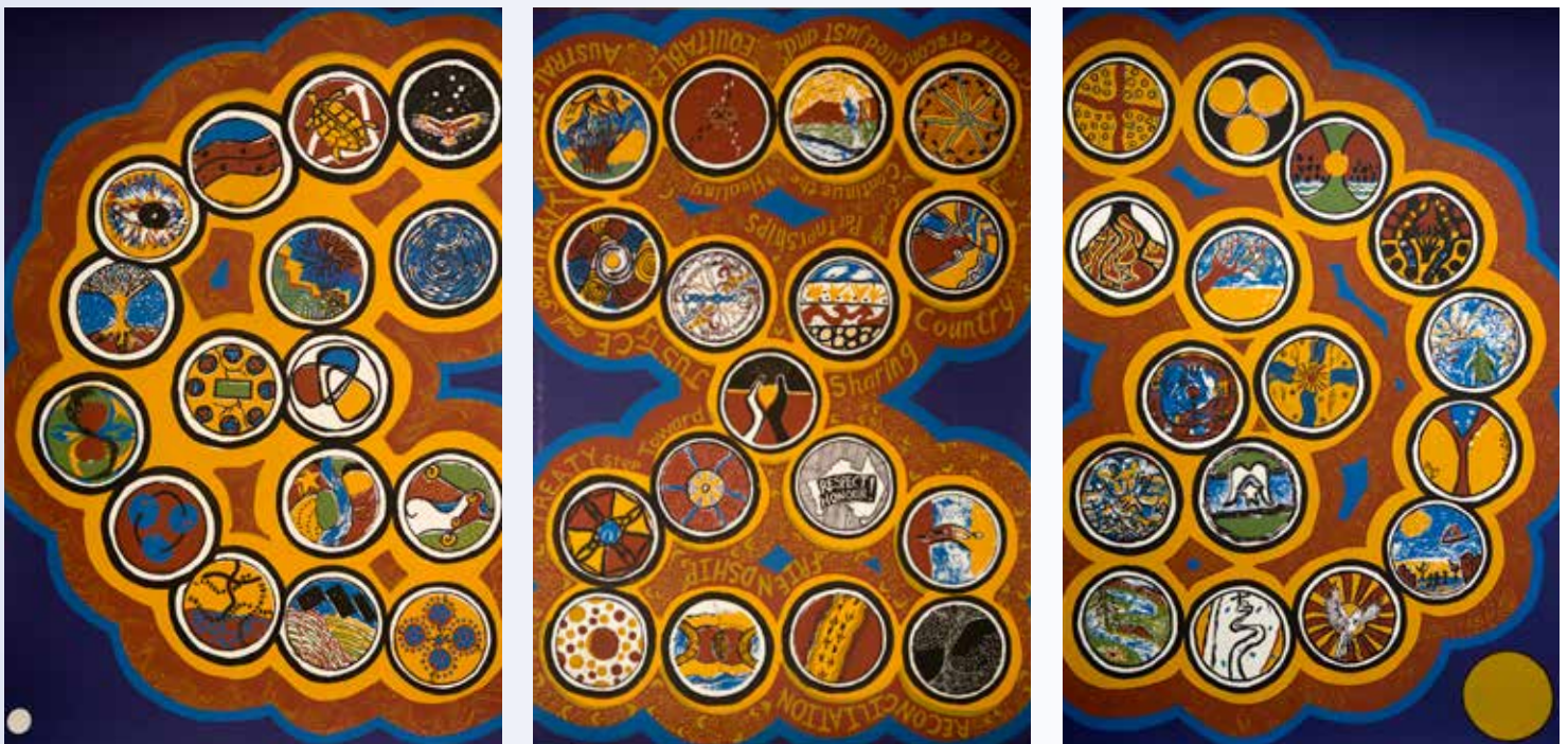
Below: Reconciliation Action Plan Collaborative Art Project 2016

Special thanks to Boomalli Aboriginal Arts Co-operative for the use of their premises for the making of part of this collaborative artwork.